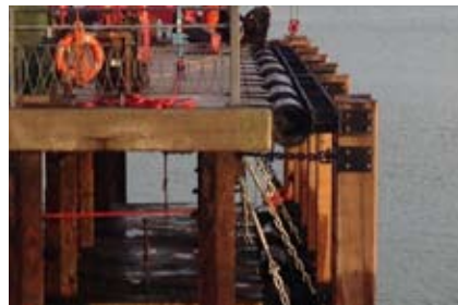
Repairs finished at Llandudno

Waverley was made very welcome in Liverpool last year and we will be returning to the Cruise Terminal for two days at the end of August. Llandudno Pier has, at long last, been completed and we are looking forward to being part of the opening celebrations.