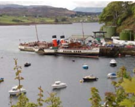
Waverley returns to Portree in 2014

Waverley will begin her season on the last Bank Holiday weekend in May. Unusually she will sail on the Clyde for this weekend and then make her annual sail round the Mull of Kintyre to Oban to position for her Western Isles programme. She will visit Skye, with a return to Portree, Kyle of Lochalsh, Gairloch and Raasay, along with her traditional weekend sailings out of Oban. You may notice that Fort William pier does not feature this year as there are problems with the fendering. If you want to enjoy all these sailings - you can purchase a special ticket to cover them all.